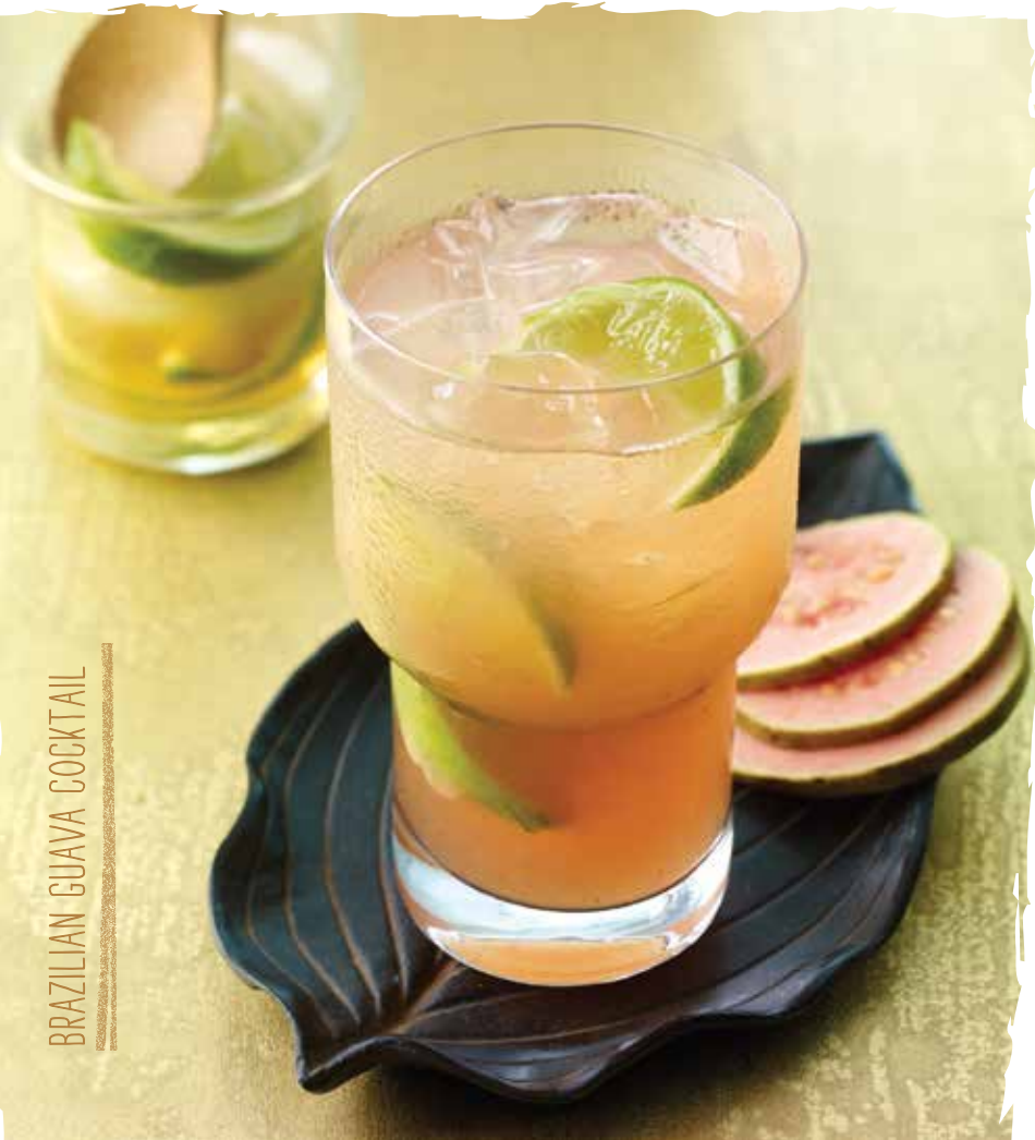
BRAZILIAN GUAVA COCKTAIL

THE WORLD IS ABOUT TO SHINE ITS SPOTLIGHT ON BRAZIL,