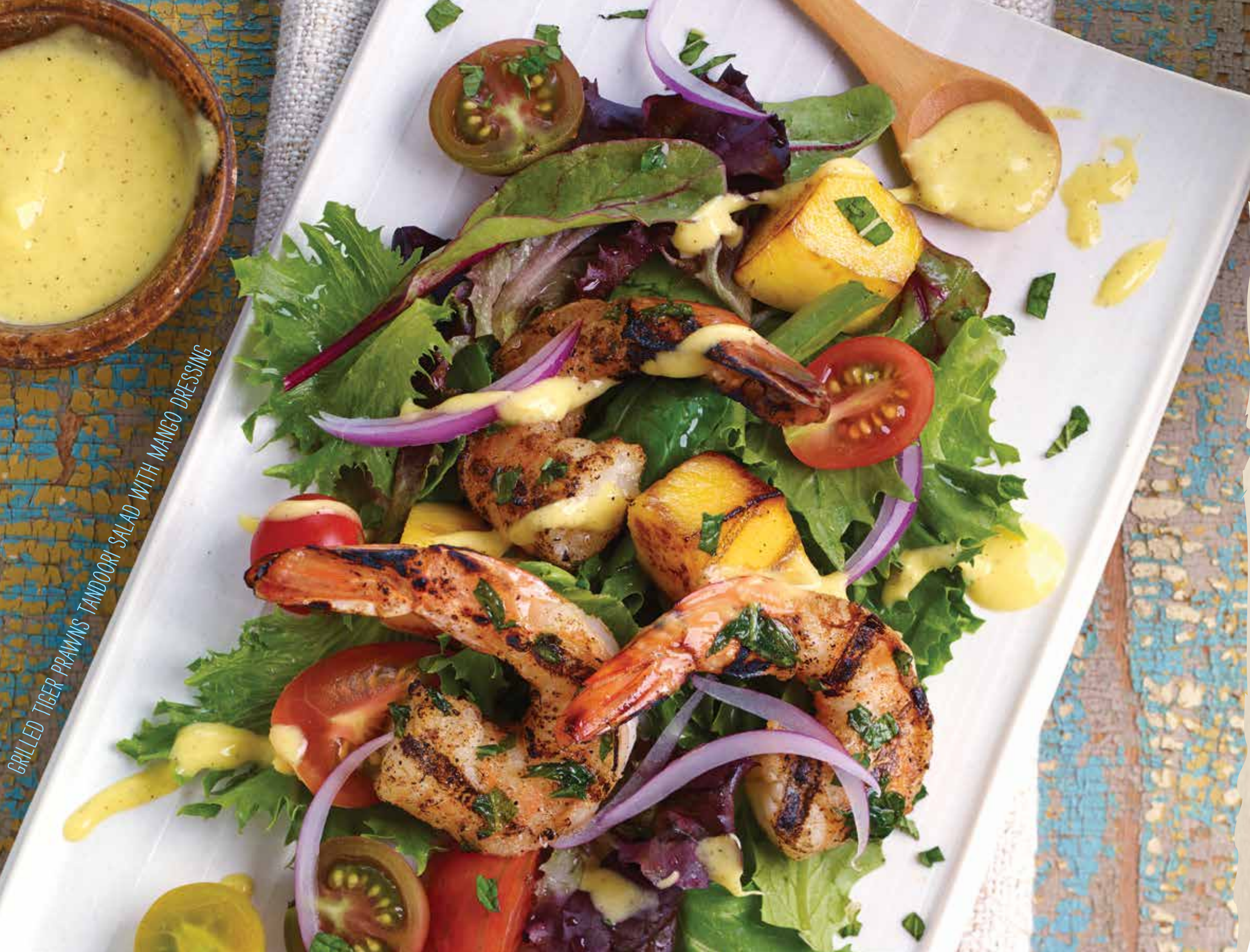
GRILLED TIGER PRAWNS TANDOORI SALAD WITH MANGO DRESSING