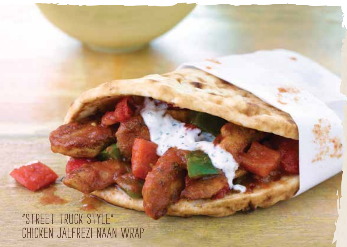
"STREET TRUCK STYLE" CHICKEN JALFREZI NAAN WRAP