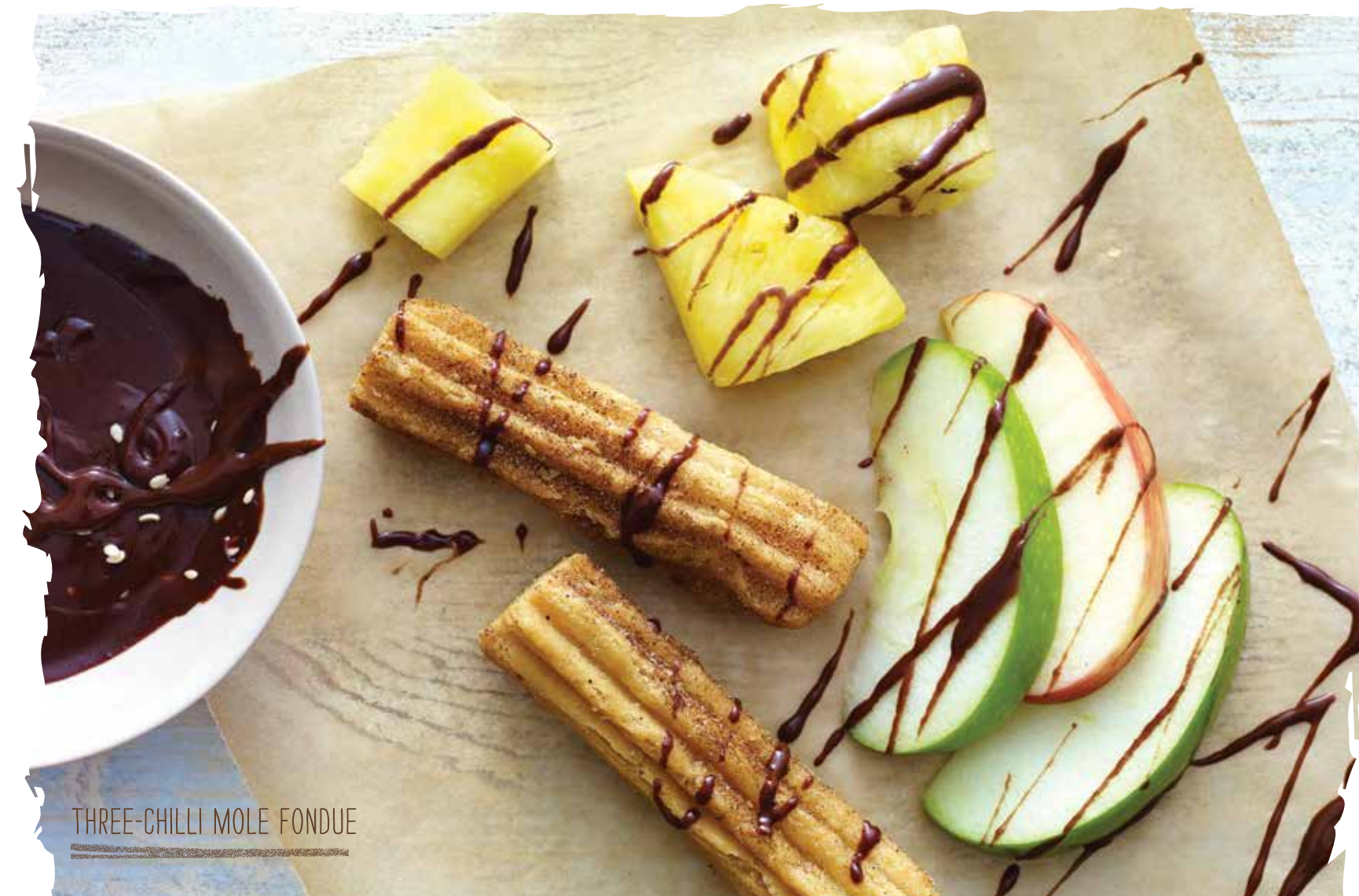
THREE-CHILLI MOLE FONDUE

These insights reflect emerging trends and key cultural influences that are shaping the tastes of tomorrow. Together, they tell an exciting story about how people everywhere are coming together for more diverse, colourful and flavourful meals than ever before.