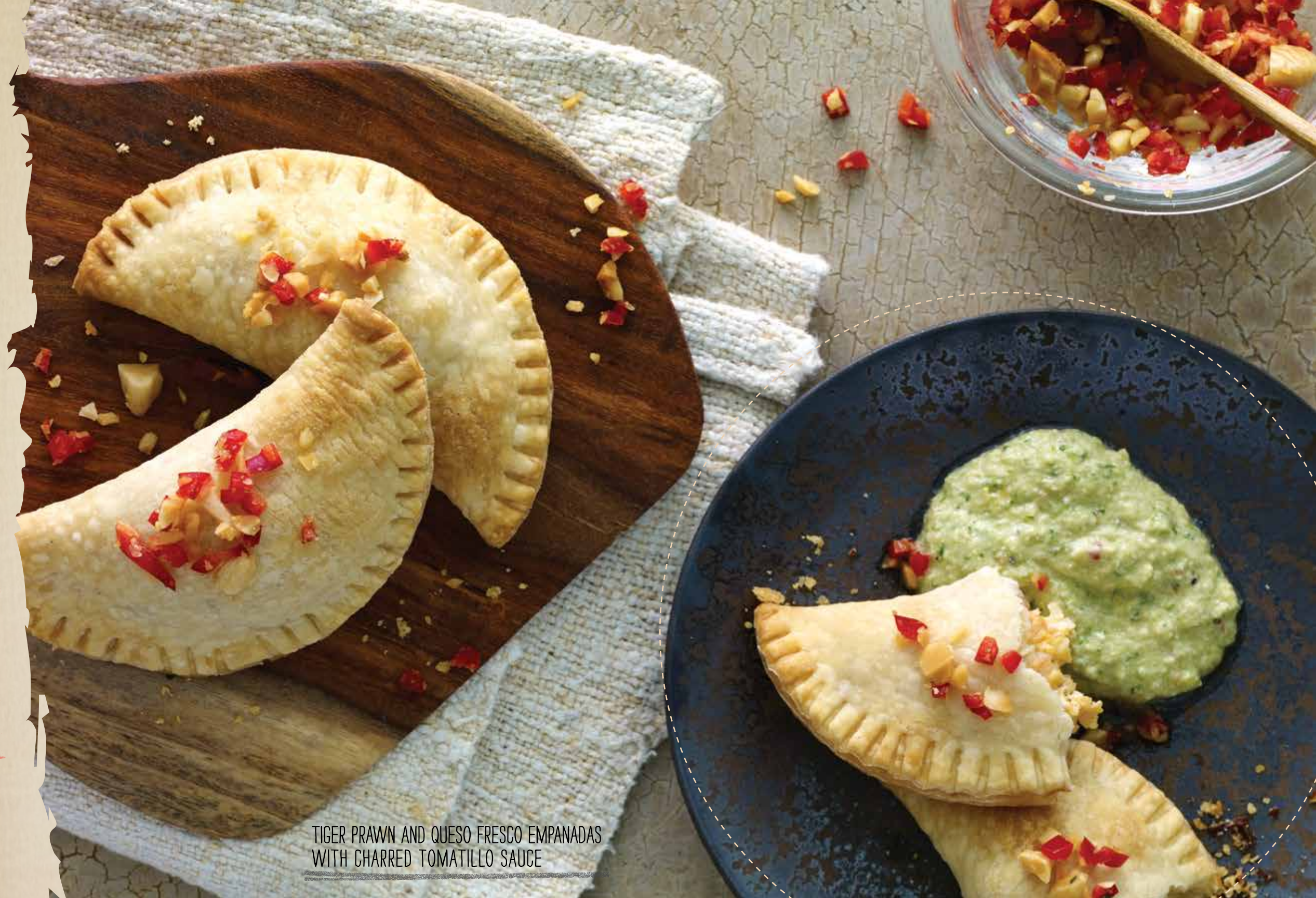
TIGER PRAWN AND QUESO FRESCO EMPANADAS WITH CHARRED TOMATILLO SAUCE