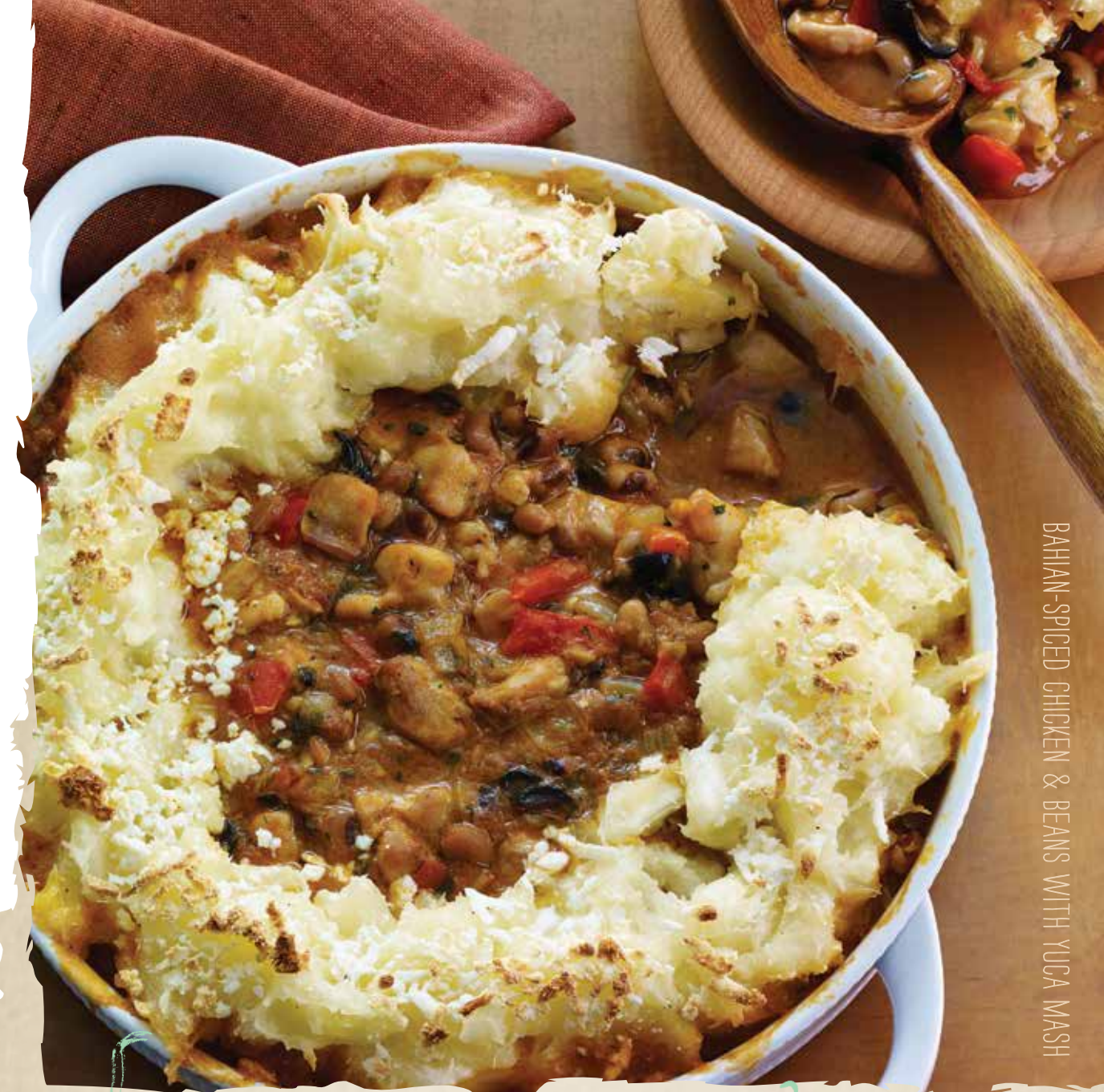
BAHIAN-SPICED CHICKEN & BEANS WITH YUCA MASH

BAHIAN SEASONING BLEND CONTAINING OREGANO, PARSLEY, VARIETIES OF PEPPER AND CUMIN