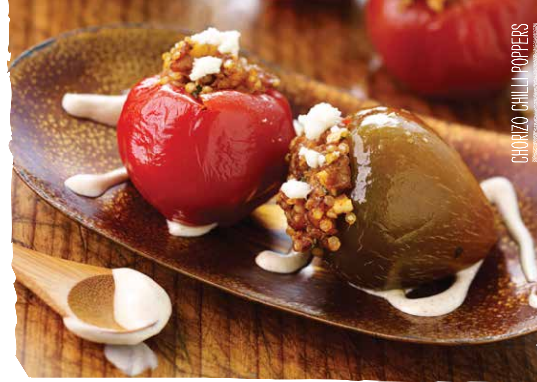
CHORIZO CHILLI POPPERS

“In Szechuan province, people eat chillies in nearly every meal, whether at street kiosks or high-end restaurants. Chillies are everywhere!” —Chef Billy Mi, China