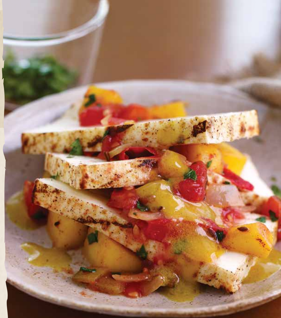
GRILLED PANEER CHEESE WITH MANGO TOMATO CHUTNEY & CURRY VINAIGRETTE