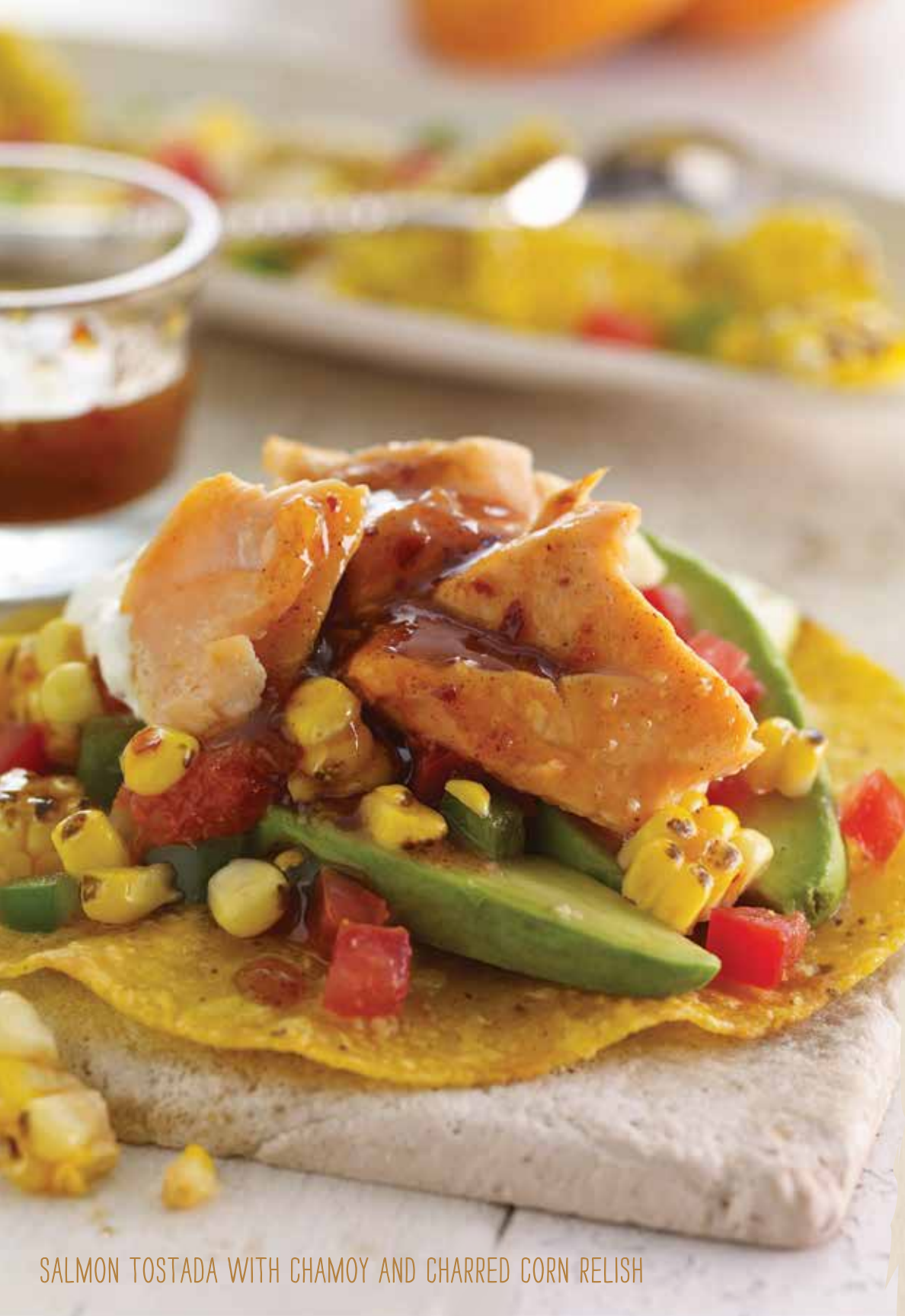
SALMON TOSTADA WITH CHAMOY AND CHARRED CORN RELISH