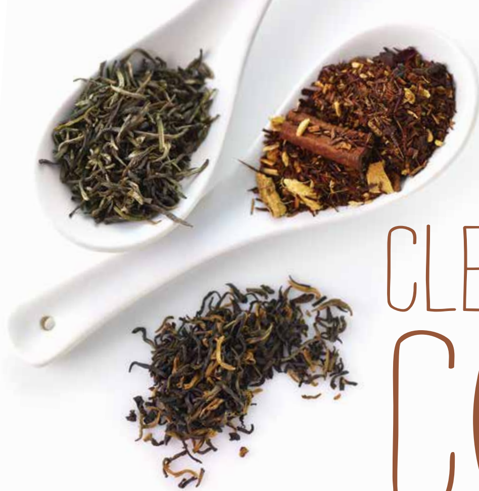
VEGETABLE "PHO" WITH TEA BROTH

"Noodles of all shapes and sizes, whether dried or fresh, are some of the most versatile ingredients you can keep on hand—especially some of the great Asian, Italian and Eastern European varieties. Creative cooks are going way beyond the basics with cool new noodle dishes." —Chef Michael Cloutier, Canada